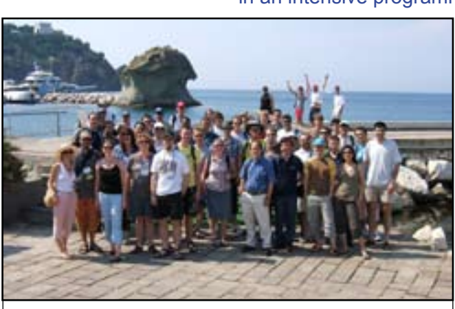
Students at the Fourth International Grid Summer School, held in Ischia, near Naples, Italy

The students received more than seventy hours of lectures, listened to over 47 presentations from 30 expert speakers and performed practical exercises on equipment installed on the school site. The testbed was established locally and was connected to major international Grid resources and thus provided a rich and challenging environment for hands-on